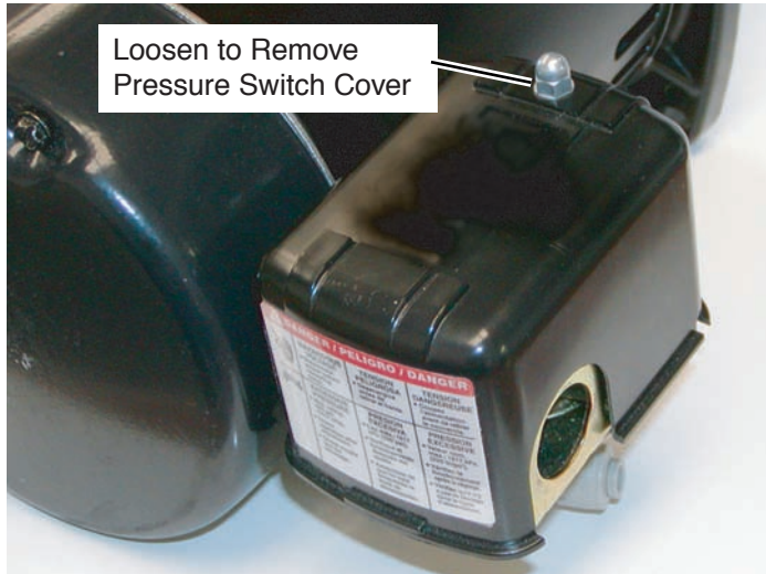
Figure 1: Pressure Switch Location

The starting and stopping of the pump is controlled by the pressure switch.